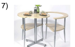
the little table